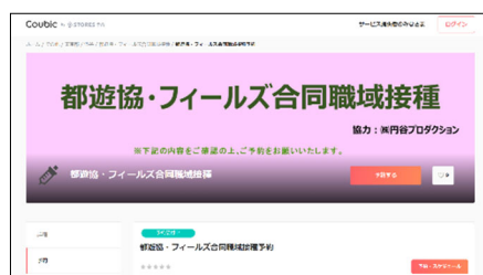
Reservation website for the joint vaccinations by Toyukyo and FIELDS Corp. for Toyukyo members