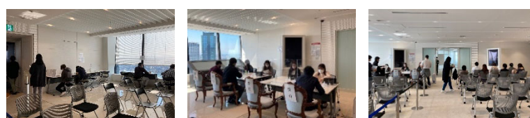
Reception and confirmation of documents (place to fill in documents, reception standby)